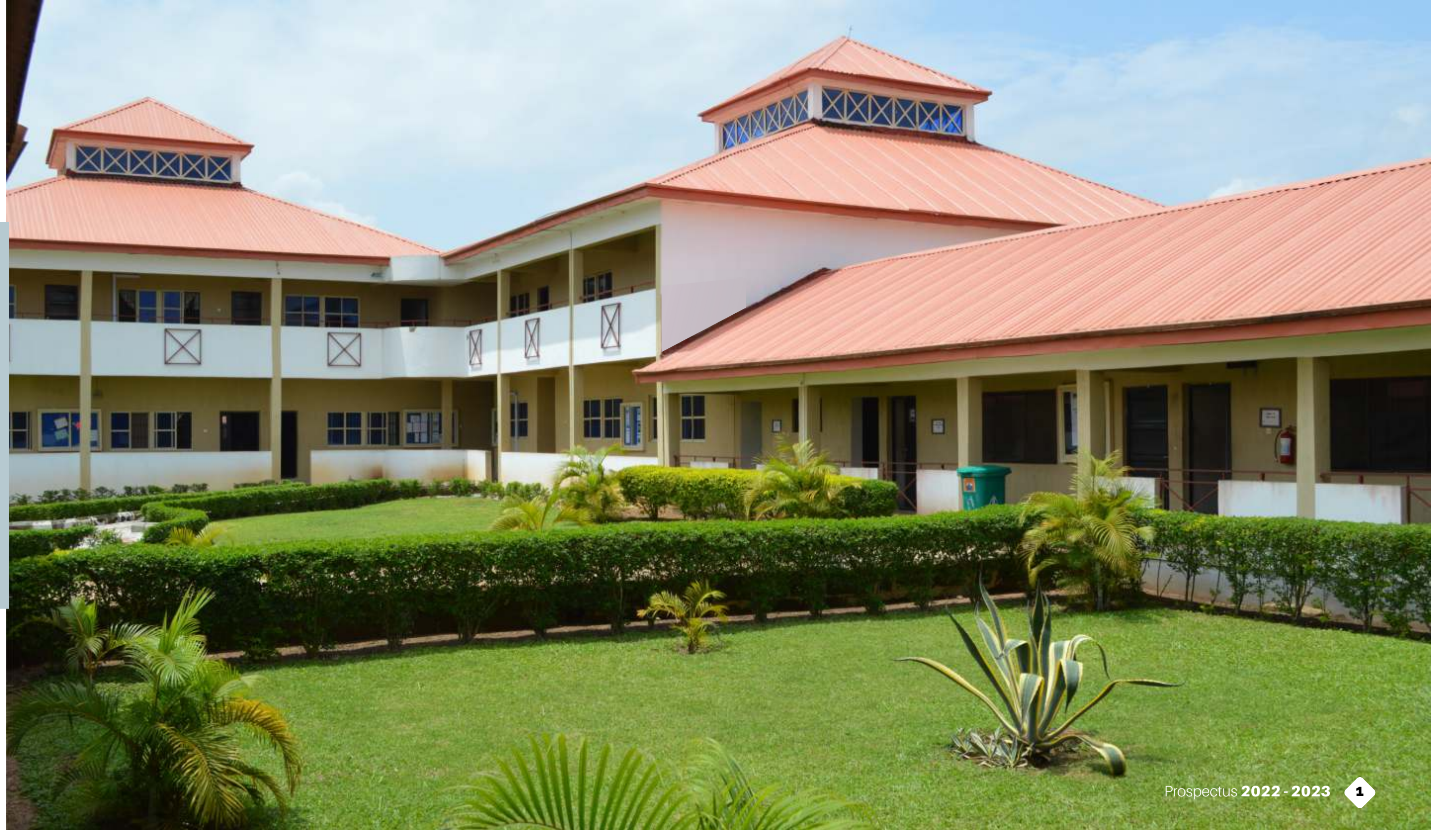
Photo: Cross-section of the Junior Secondary Classes